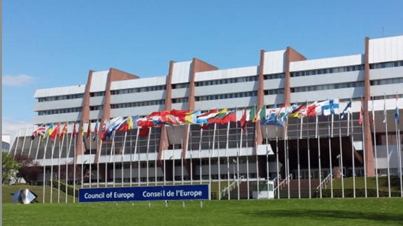
Council of Europe

In Strasbourg, experience total immersion in Europe and discover at the same time the jewels of contemporary architecture.