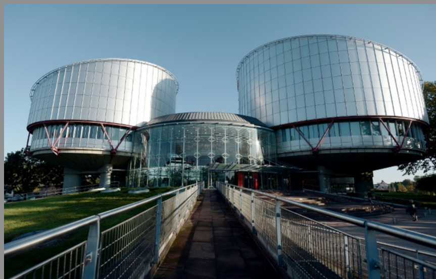
European Court of Human Rights